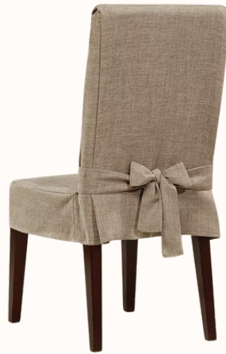
Classic w/Bow Chair / Seat & Bow at Back