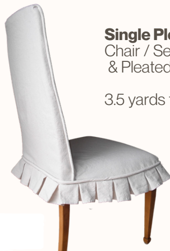
Single Pleat Skirt Chair / Seat & Pleated Skirt