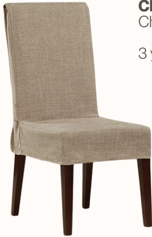
Classic Fit Chair / Seat