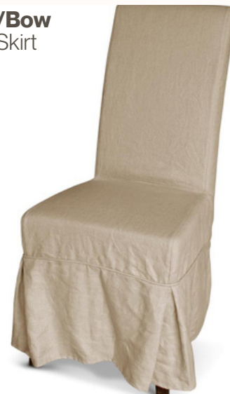
Romantic Rustic Full Length Chair / Seat w Side Pleat Skirt