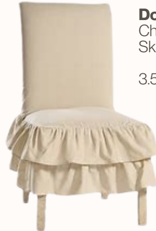
Double Ruffle Skirt Chair / Seat & Ruffled Skirt