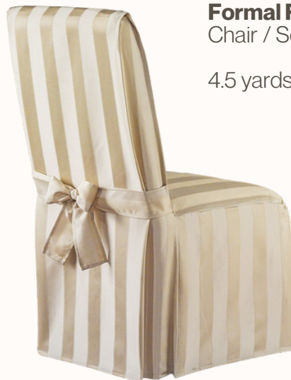
Formal Full Length w/Bow Chair / Seat w/ Bow & Skirt